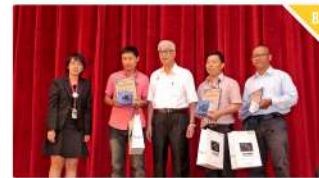
A. The winners of the Photojournalism category for Penang Green Journalism Award 2014.

(See Appendix 2 for Penang Green Journalism Award Winners List.)