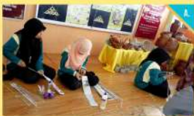
A. SMK Sri Muda, Penaga students demonstrating weaved baskets from used magazines and newspapers during the Green School Award audit session.