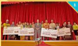
B. The winners of the Penang Green School Awards with Penang Chief Minister cum PGC's Chairman, YAB Tuan Lim Guan Eng, at the Green Penang 3A Gala 2014.