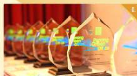
D. Penang Green Office Project certificates and plaques – a recognition for strong commitment towards positive environmental and behavioural change for office environment.