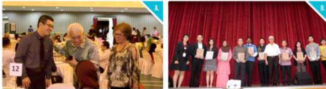
A. Our valued partners engaging to each other at the Green Pinang 3A Gala ceremony.

(See Appendix 4 for Green Pinang 3A Gala Recipients List.)